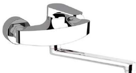
IMMAGINE - IMAGE