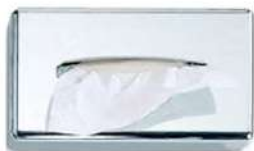
IMMAGINE - IMAGE